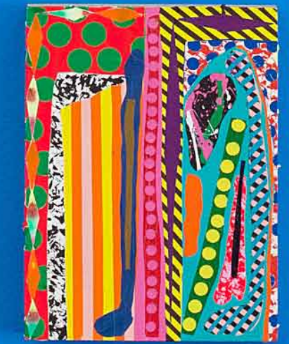
Rattlesnake Chamber When We Die 2018 Mixed media 8 x 6 x 1"

Kundalini Tour Guide 2018 Mixed media 17 x 14 x 1"