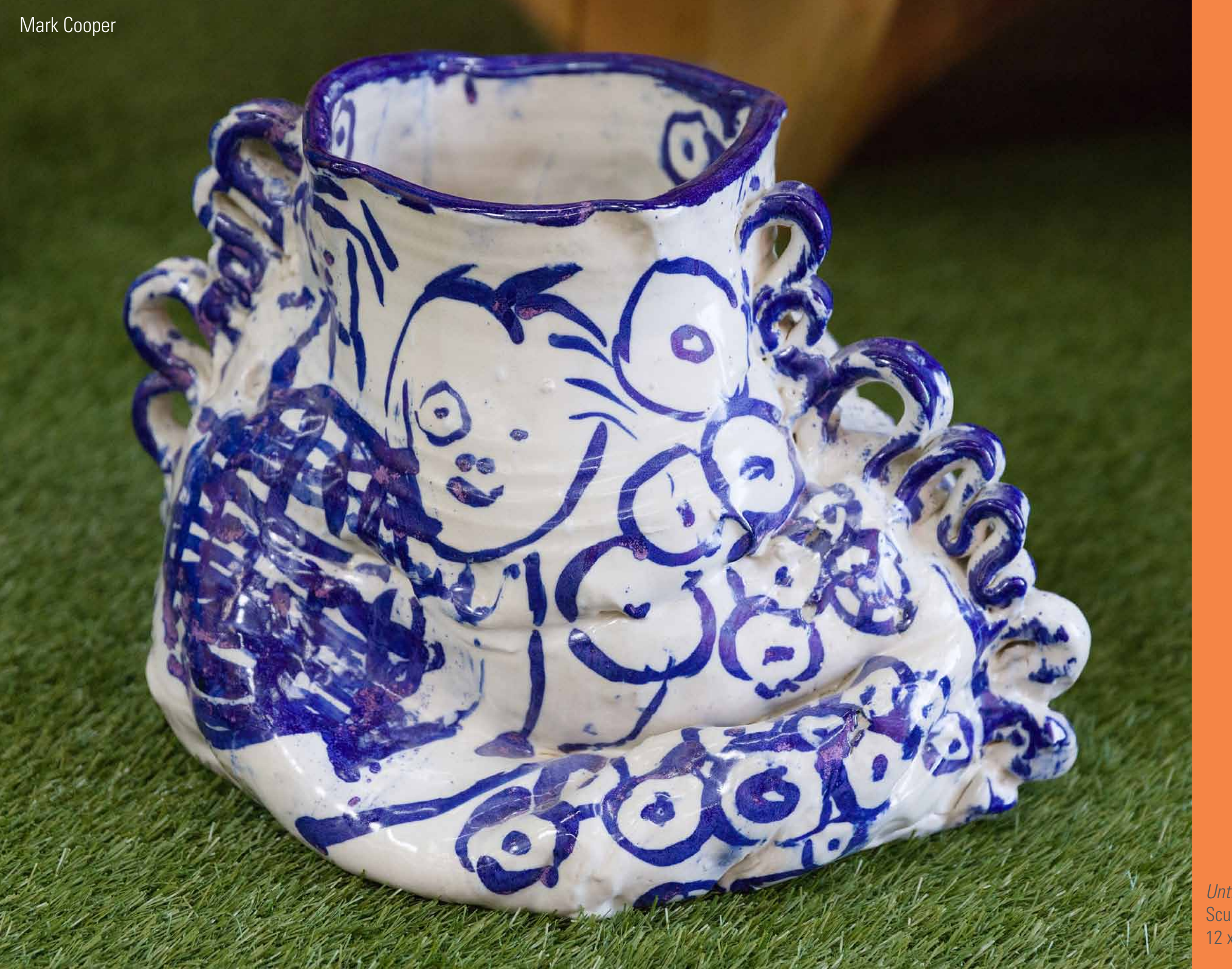
Untitled Sculpture, ceramic 12 x 17 x 12"