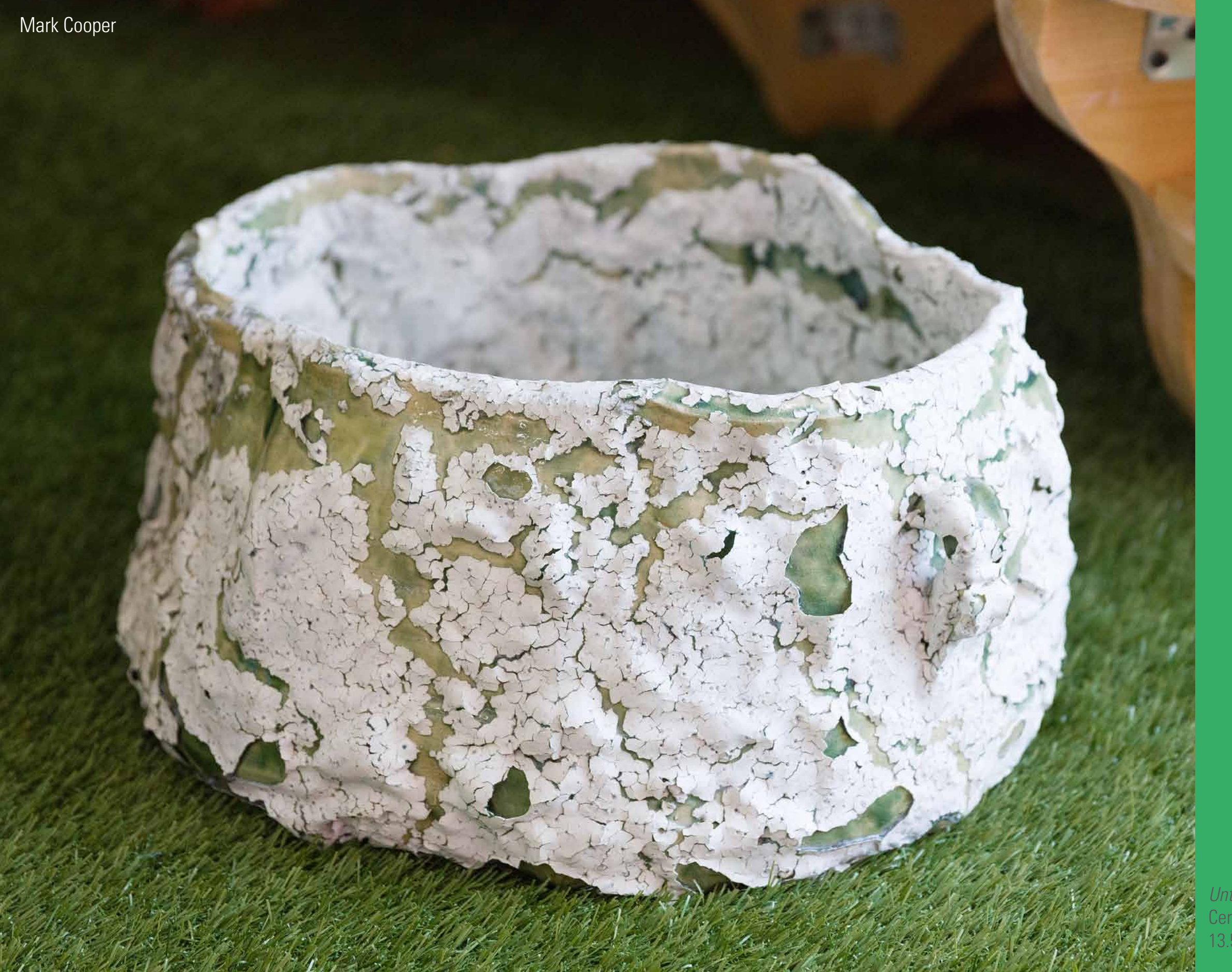
Untitled Ceramic 13.5 x 16 x 12