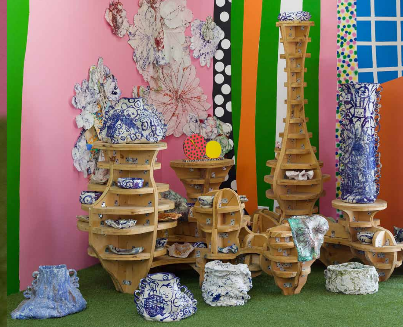
Untitled Sculpture, ceramic 14 x 20 x 12"