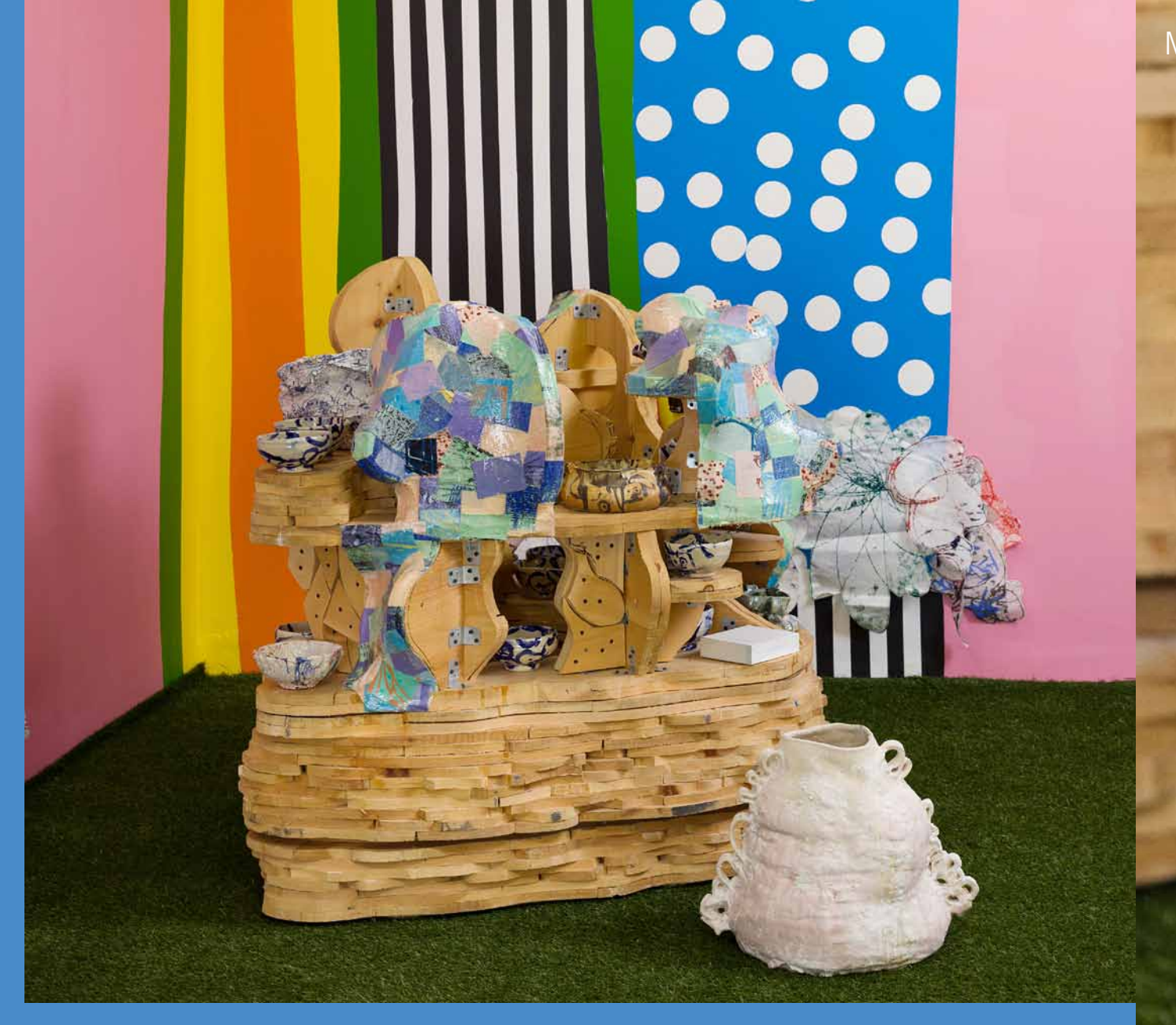
Untitled Sculpture, ceramic 17 x 15 x 12"