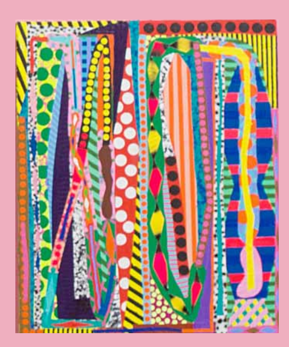
A Presentation to the Abyss 2018 Mixed media 17 x 14 x 1"