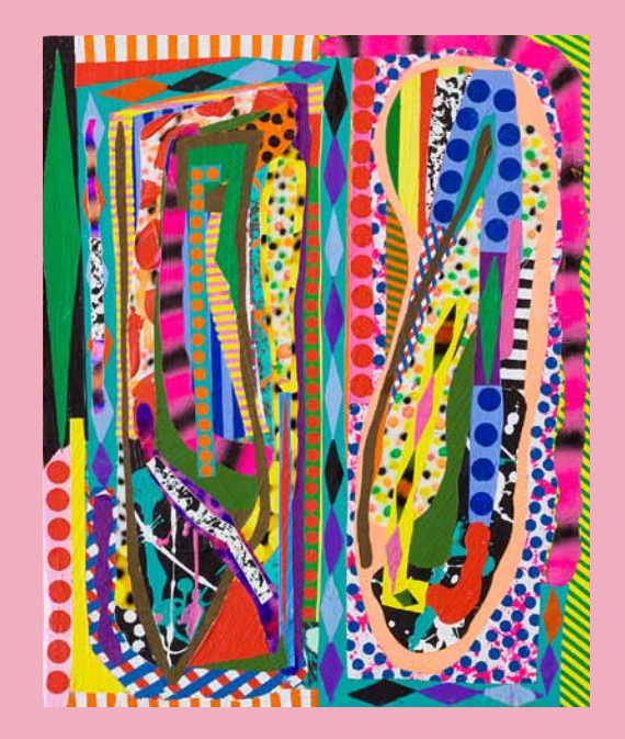
Untitled Chamber: Butterfly Chaser Swamp Kisses 2018 Mixed media 17 x 14 x 1"