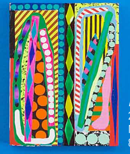
Ecstasy of a Nameless Virgin 2018 Mixed media 8 x 6 x 1"