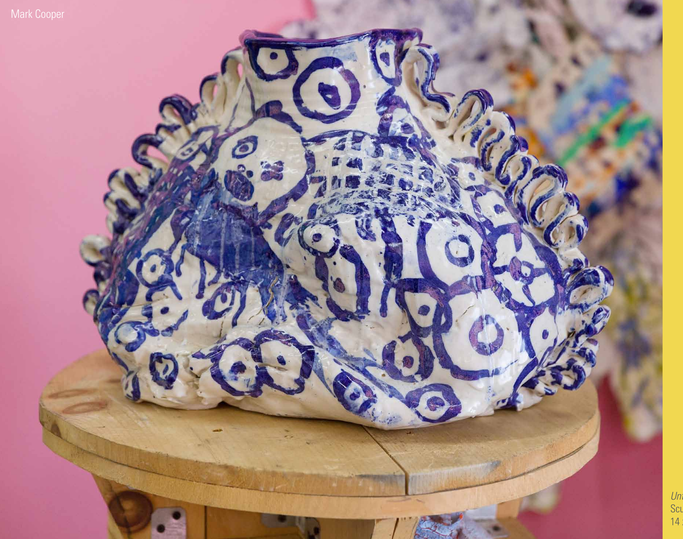
Untitled Sculpture, ceramic 14 x 20 x 12"